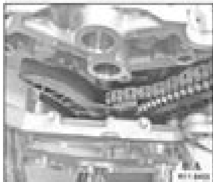
Fig. 78. Identifying Chain Tensioner Arm

Release cylinder head screws at front of cylinder head.