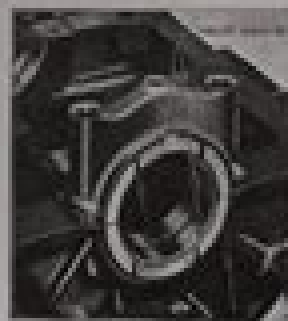
FIG. 7. TIGHTENED TIGHT BOND