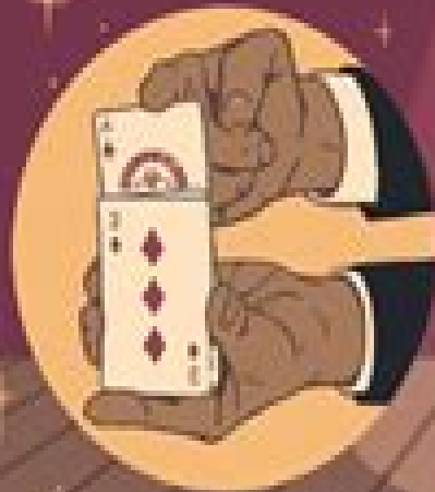
The Rising Card