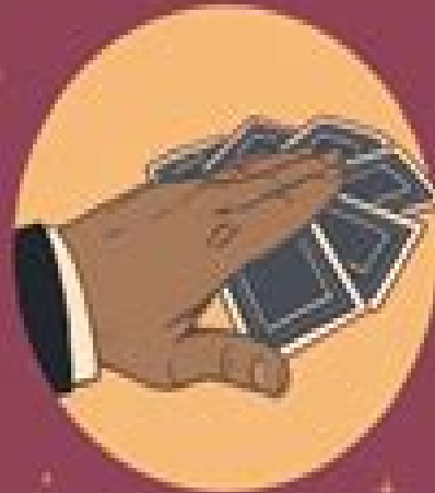
The Magnetic Hand