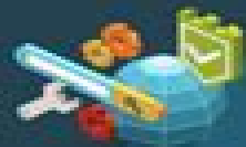
DATA ANALYSIS TOOLS