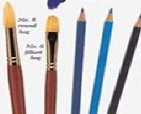
No. 8 round brush