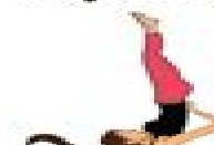
SHOULDER STAND Le Chendelle