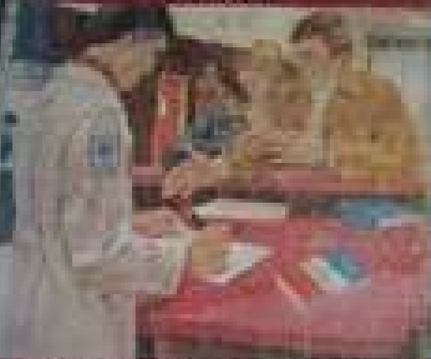
Chassis-Body Service Manual