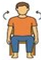
Seated Shoulder Rolls

Sit upright, feet flat on the floor, lengthen your spine, shoulders relaxed, palms resting comfortably on thighs.