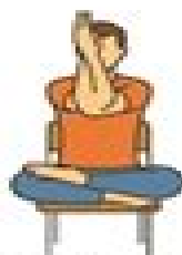
Seated Eagle Arms

Cross arms in front, intertwining forearms and wrists, lifting elbows slightly, feeling a gentle stretch between shoulder blades.