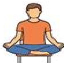
Easy Pose (Sukhasana)

Sit comfortably with your back straight, hands resting gently on knees, breathing deeply to center yourself.