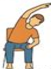
Seated Side Stretch

Cross arms in front, intertwining forearms and wrists, lifting elbows slightly, feeling a gentle stretch between shoulder blades.