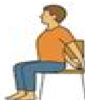
Seated Chest Opener

Rotate your upper body gently to one side, holding the chair for stability, then repeat on the opposite side.