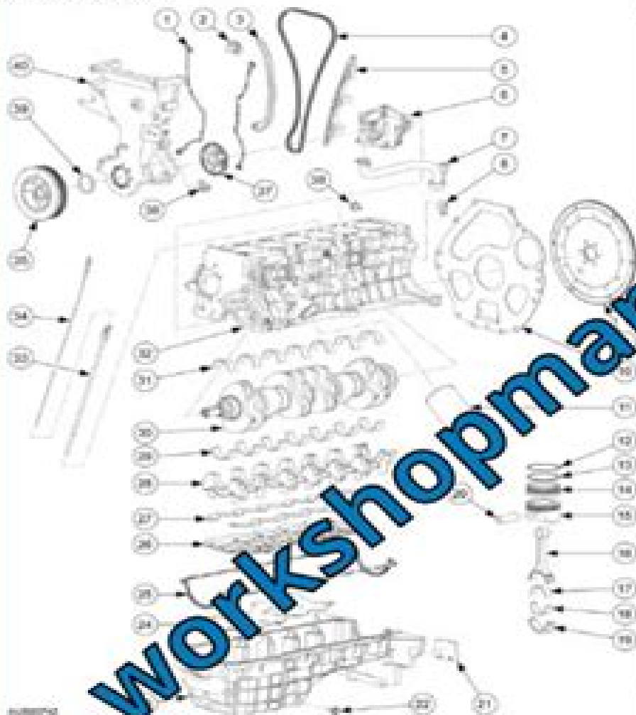
Lower Engine Components