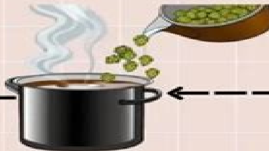
Step 5: Boiling and Hopping