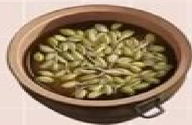
Step 1: Malting