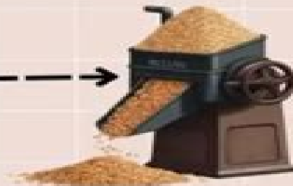
Step 2: Milling