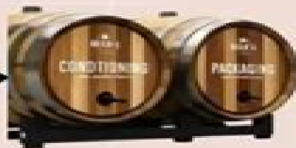
Step 7: Maturing