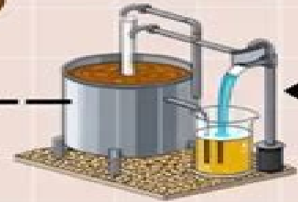
Step 4: Lautering