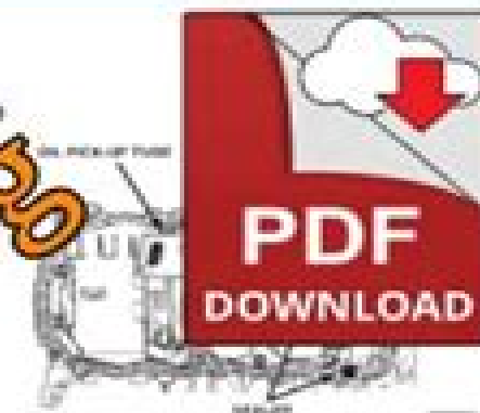
Fig. 25 Oil Pan Gasket Installation