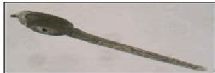
tunicate (sea squirt) larva

This "tadpole" is an early life stage of a tunicate. Tunicates are related to humans because they have a notochord, although it disappears as the larva matures. Sea squirts, found in the invertebrate lab, are adult tunicates.