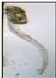
adult Oikopleura sp.

Barnacle nauplii are distinguished from crab larvae by the "spikes" on their heads. This stage comes before the cypris stage.