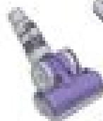
Copyright © 2004 Wiley Periodicals, Inc.