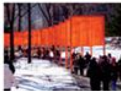
This is a photograph of a sculpture by a contemporary artist. The sculpture is made of a dark material, possibly metal or stone, and it has a smooth, polished surface. It is a dark, abstract shape that resembles a human figure or a piece of furniture.