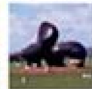
This is a photograph of a sculpture by a contemporary artist. The sculpture is made of a dark material, possibly metal or stone, and it has a smooth, polished surface. It is a dark, abstract shape that resembles a human figure or a piece of furniture.