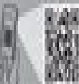
Figure 1: Dell EMC PowerEdge T340 server components.

Get started with your Dell EMC PowerEdge T340 server. This guide provides information on the server's features, specifications, and how to get started with your server.